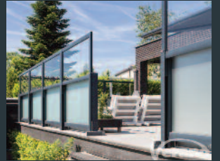
RETRACTABLE PARAPET GLASS